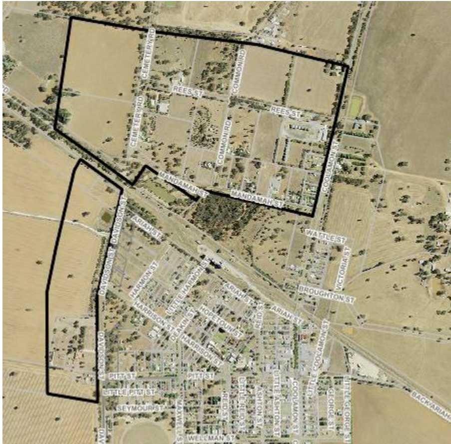
Map 1: Boundary of subject land

The existing zoning of the subject land is shown by Map 2.